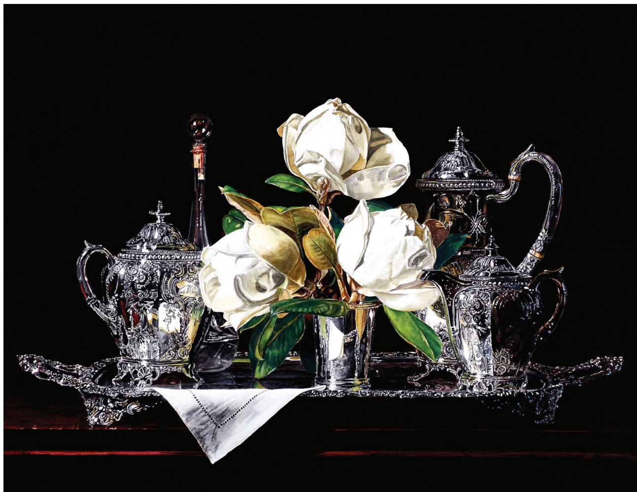
"Magnolias and Silver" by Laurin McCracken Watercolor on 100% Cotton rag paper

The photo of the final painting (below) was taken with a Canon EOS SD5 to create the highest possible image.