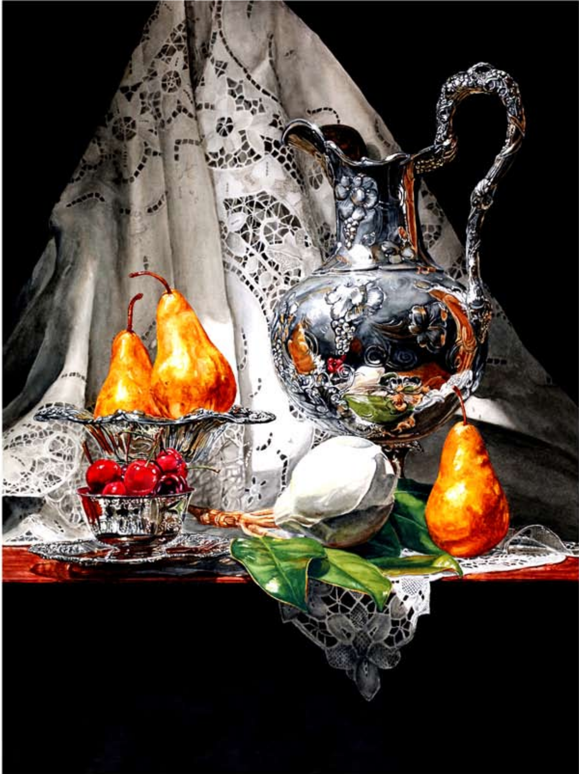
"Silver, Cherries, Pears & Magnolia" - Laurin McCracken